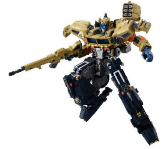
OVERGEAR Optimus Prime