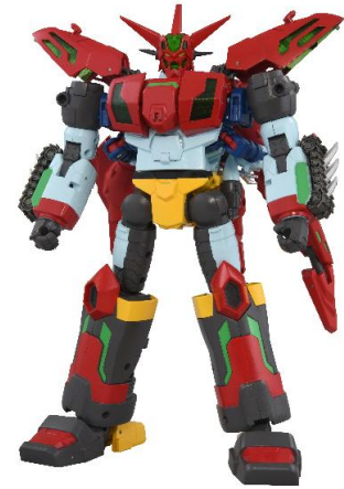
Force Getter Robo product image