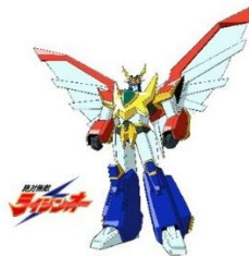
Brave Series color references: Fire Dagwon (left) / Choryujin (center) Eldran Series color references: Raijin-Oh (right) ©サンライズ © TOMY