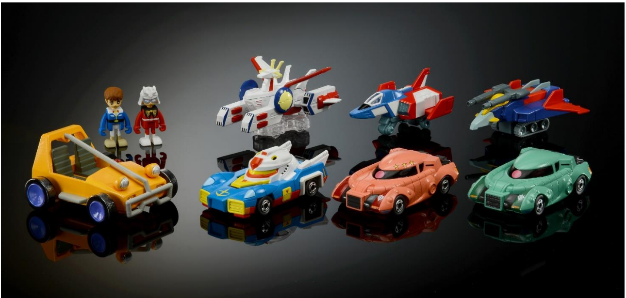
At the far left “Dream TOMICA Ride On Mobile Suit Gundam BUGGY”