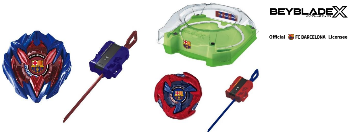
Left: BEYBLADE X "UX-00 STARTER DRANBUSTER 1-60A METAL COAT: BLUE FC BARCELONA Ver.

Prior to their release, a limited number of units of these two products will be sold at the "Asia Championship 2024" (*), an event to be held at the Fountain Plaza (alpa B1 basement) of the Sunshine City commercial complex in Tokyo's Ikebukuro district on Sunday, December 1, 2024, to determine the best Blader. (The two products will be sold only on that day at the Ikebukuro Sunshine City store of Toys"R"Us and Babies"R"Us.)